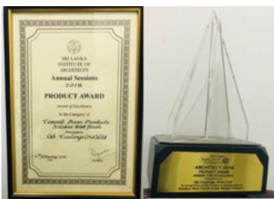
Product Excellence Architect 2018