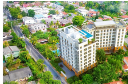
Bricks gate apartment - Wattala