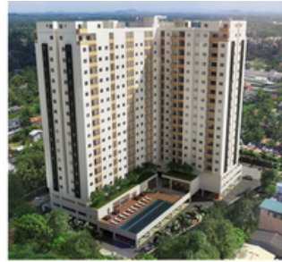
Fairway Apartment Koswaththa