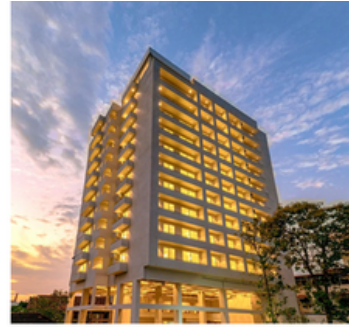
Maga Engineering - Aster Apartment