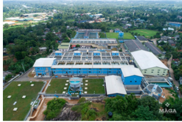
Water project - Kelaniya