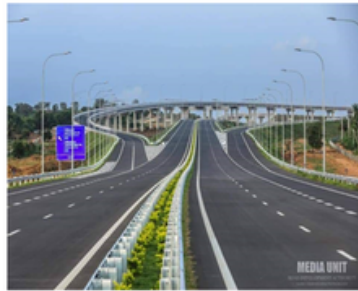
Southern Expressway Hambanthota - CSCEC