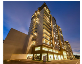
Fairway - Galle