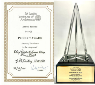
Product of Excellence Architect 2023