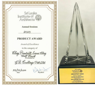
Product of Excellence Architect 2023