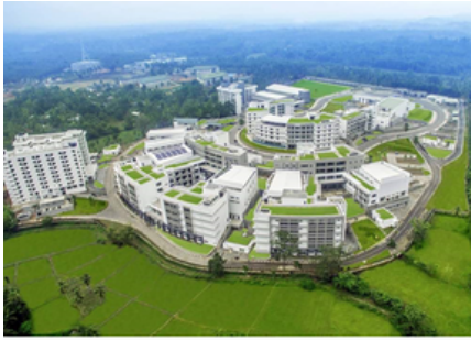
NSBM University Complex Homagama