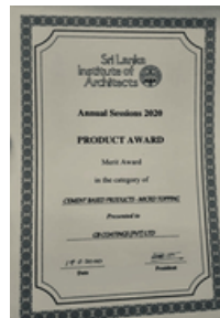
Product Merit Award Architect 2020