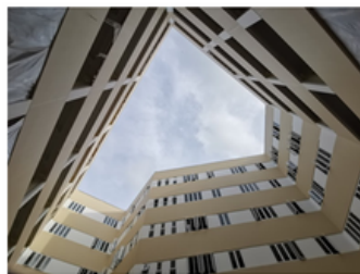
Maternity Hospital - Karapitiya