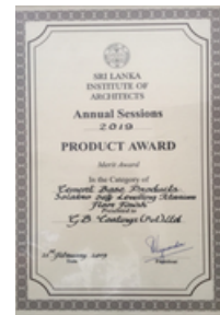
Product Merit Award Architect 2019