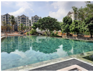
Ariyana resort - Athurugiriya