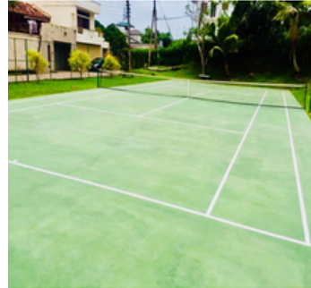
Bankhill Garden Residents Palawatta