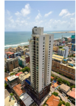
Luxury Apartment - Deal Place