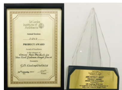
Product Excellence Architect 2017