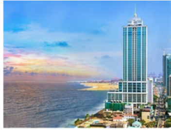
Grand Hyatt - Colombo