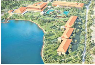
Benthot Beach Hotel By Cinnamon