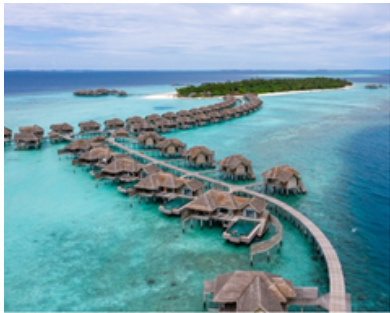
Wakkaru Resort - Maldives