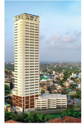
Maga One Building Nawala